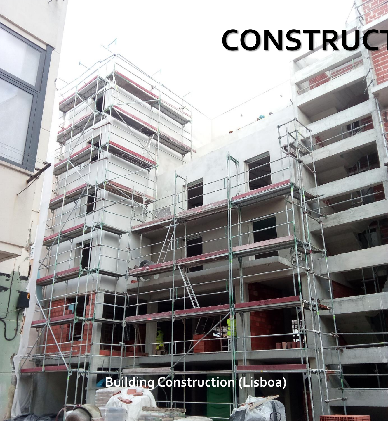
Building Construction (Lisboa)