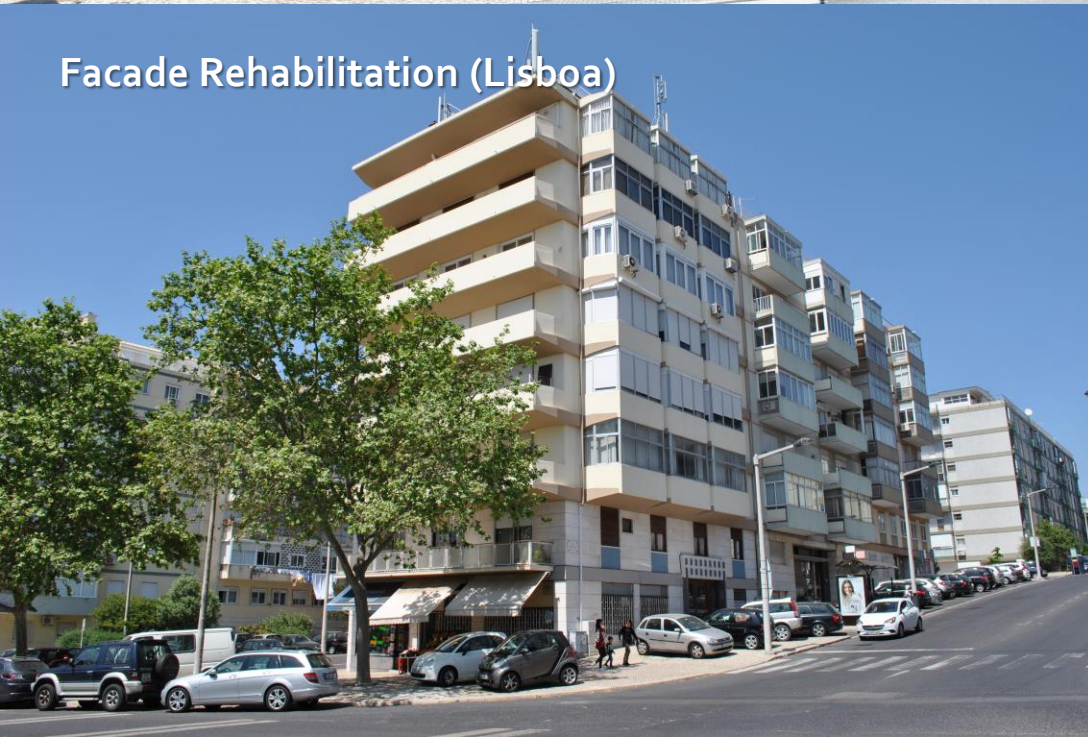
Facade Rehabilitation (Lisboa)