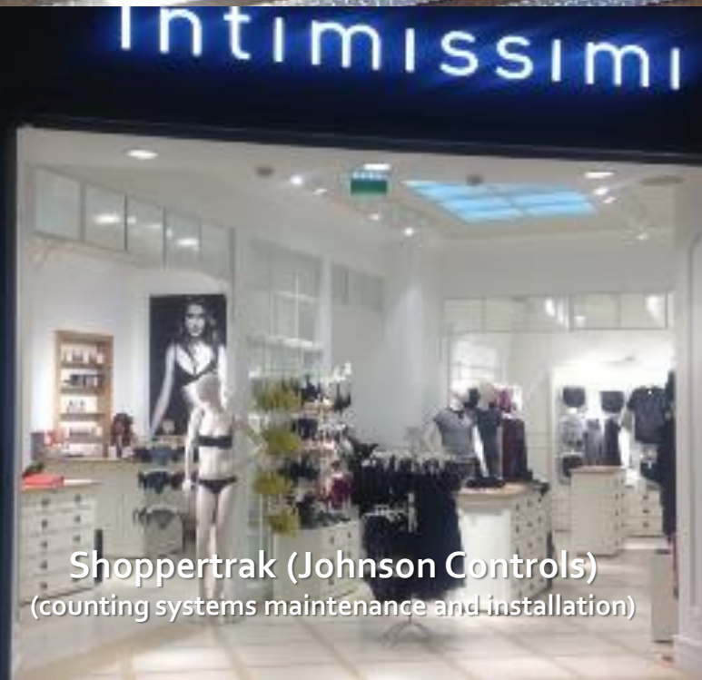
Shoppertrak (Johnson Controls) (counting systems maintenance and installation)