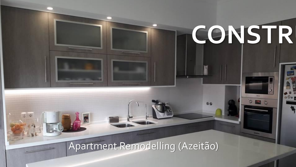
Apartment Remodelling (Azeitão)