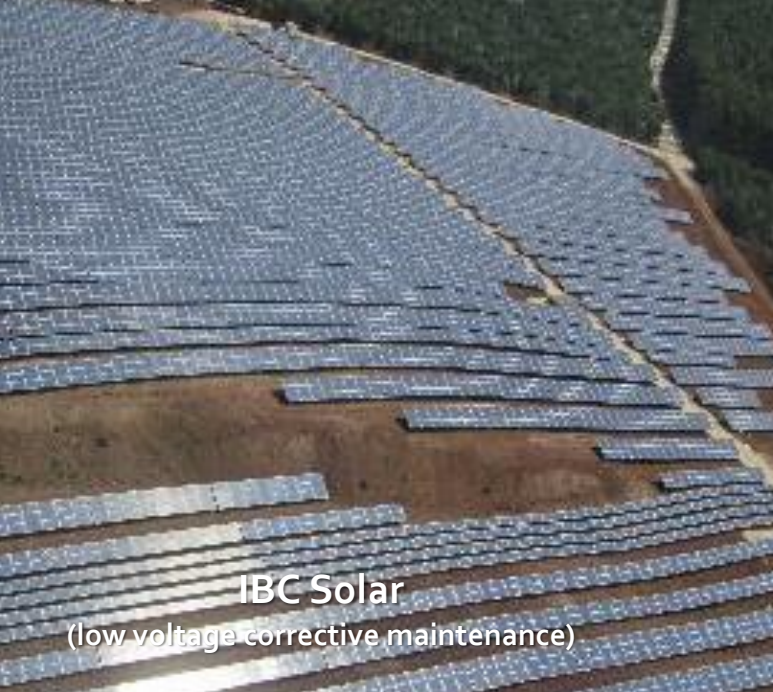
IBC Solar (low voltage corrective maintenance)