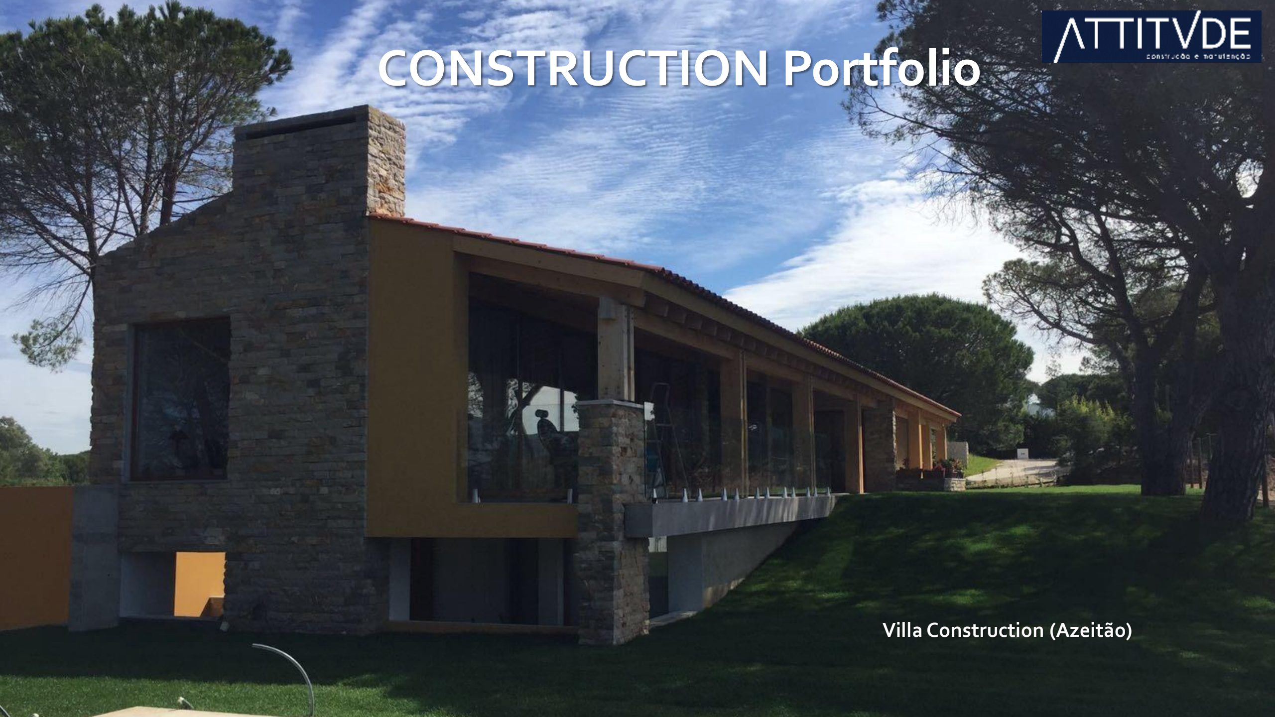
Villa Construction (Azeitão)