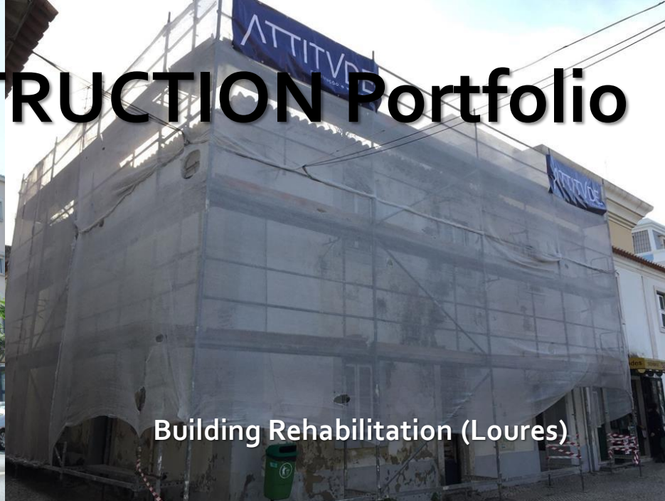
Building Rehabilitation (Loures)