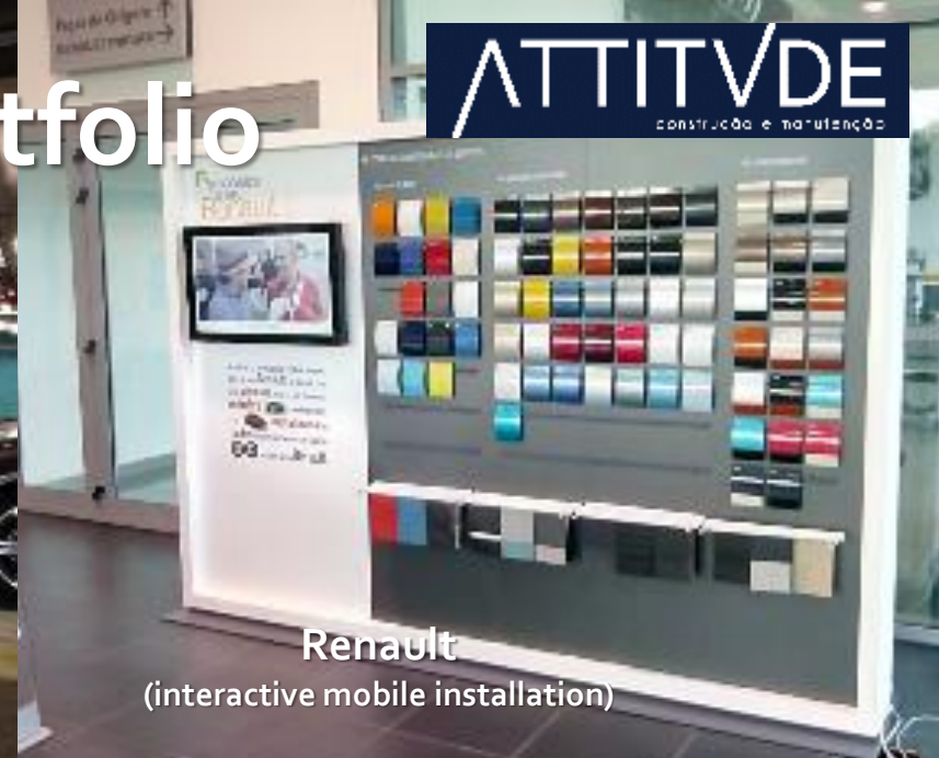
Renault (interactive mobile installation)