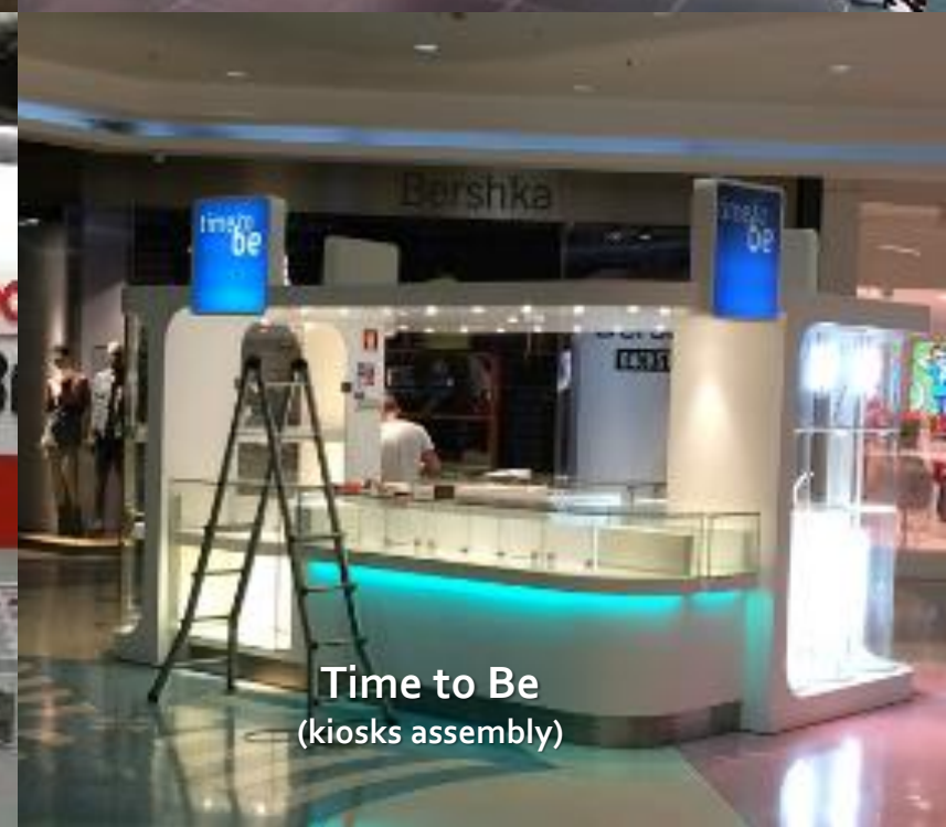
Time to Be (kiosks assembly)