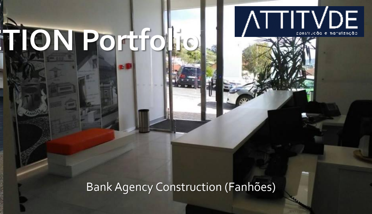
Bank Agency Construction (Fanhões)