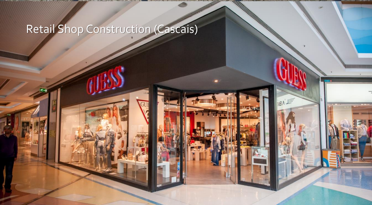
Retail Shop Construction (Cascais)