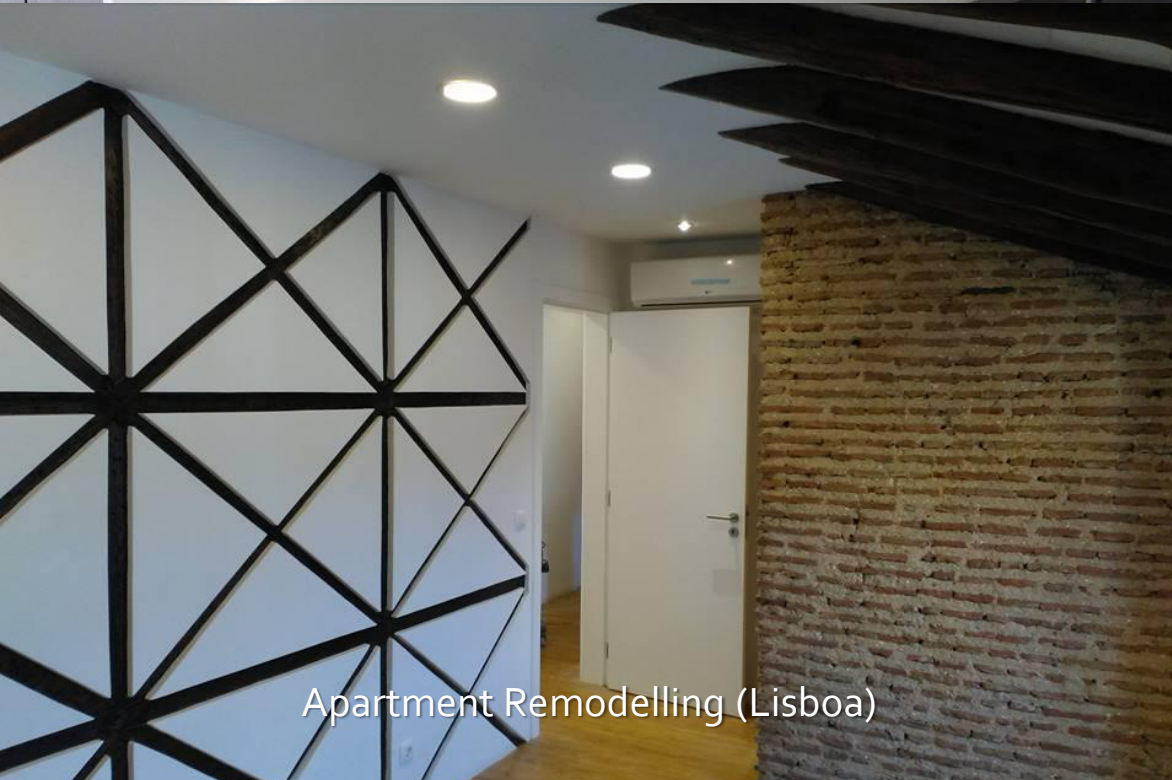
Apartment Remodelling (Lisboa)