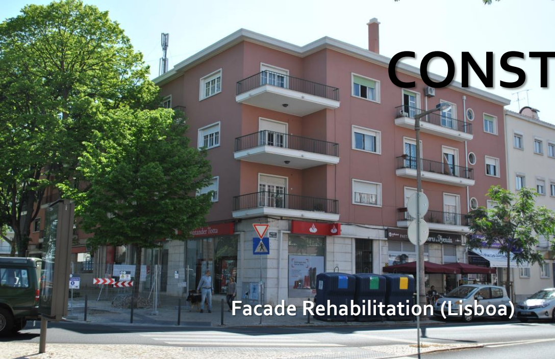
Facade Rehabilitation (Lisboa)