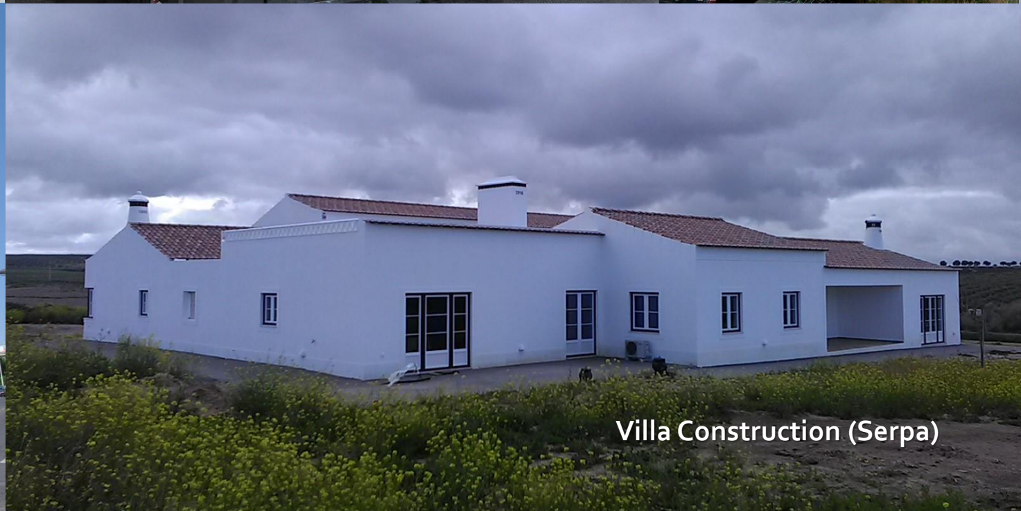
Villa Construction (Serpa)