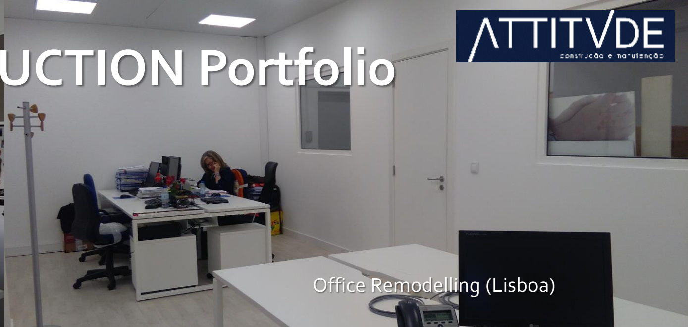
Office Remodelling (Lisboa)