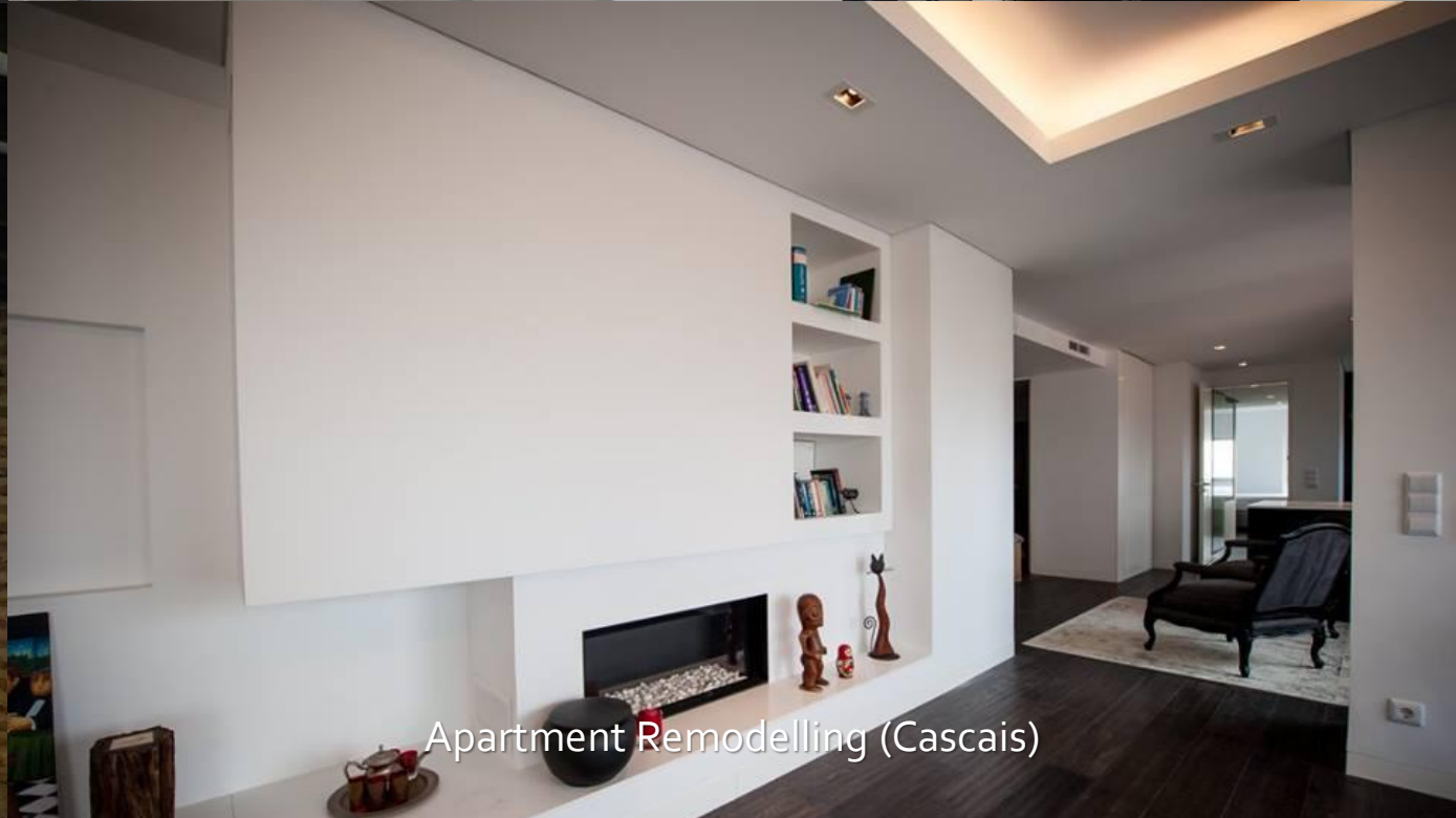
Apartment Remodelling (Cascais)