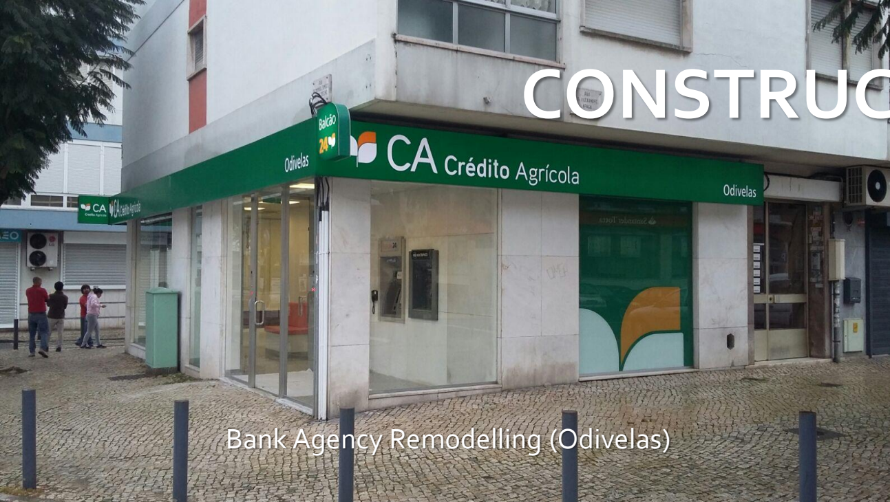
Bank Agency Remodelling (Odivelas)