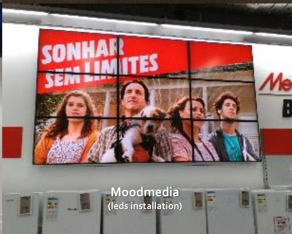
Moodmedia (leds installation)