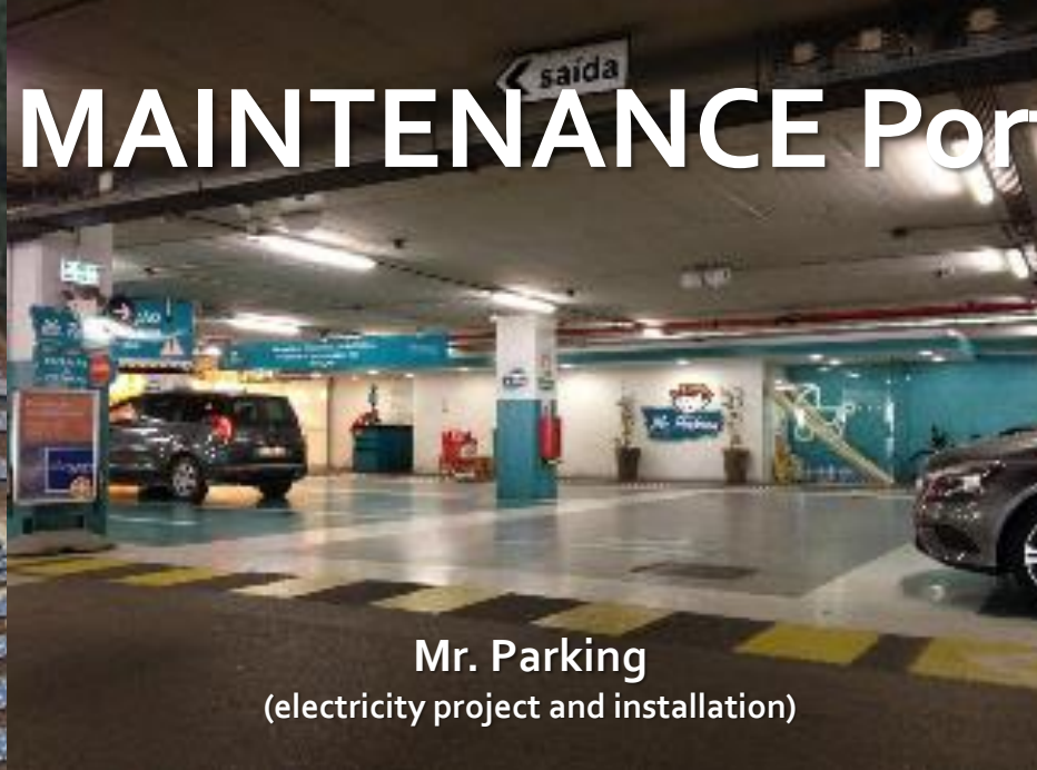
Mr. Parking (electricity project and installation)