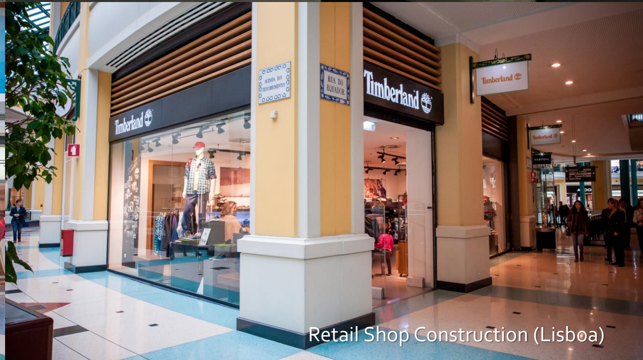
Retail Shop Construction (Lisboa)